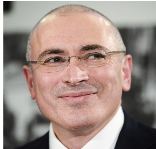
Mikhail Khodorkovsky on 22 December 2013 after his release from prison.

Fourth card: competent industrial managers and businessmen. Putin inherited the original oligarchs who had acquired the bulk of Russia's industrial assets under Yeltsin and became vastly wealthy in the process. Their wealth bought them political power, and their power protected their wealth. That was then. Once in office, Putin immediately began eroding their power. In 2000, oligarch Vladimir Gusinsky was forced to turn over his property. Fellow-oligarch Boris Berezovsky followed suit in 2001. Both promptly fled the country. By Mikhail Khodorkovsky's arrest in 2003, it had become clear a new sheriff was in town along with a new rule of the land: stay out of politics or you'll go the way of Khodorkovsky (i.e., to Medium-Security Corrective Penal Colony YaG-14/10 in Krasnokamensk, Siberia). The message was received. Owners under Yeltsin, the oligarchs under Putin eventually became mere stewards of property subject to sudden forfeiture. They now formed a new class of docile managers whose loyalty was encouraged by the threat of expropriation of their property and imprisonment of their person. Because these oligarchs made their